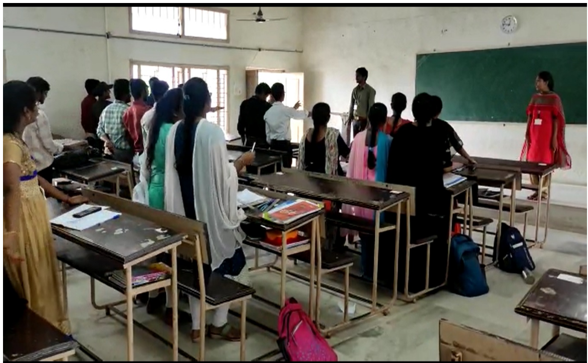
Students participating in Pledge against Drugs